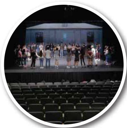
A. Bullard Theater Modernization Completed: 2013