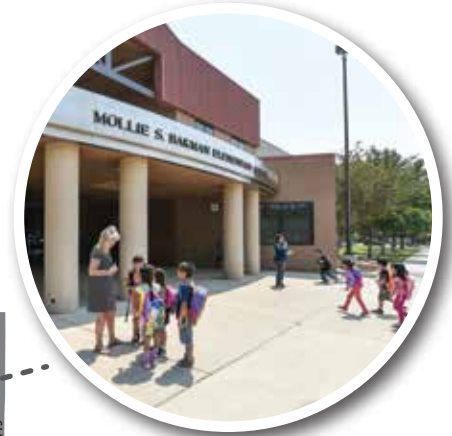
G. Bakman Elementary Completed: August 2005