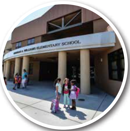
B. Williams Elementary Completed: August 2007