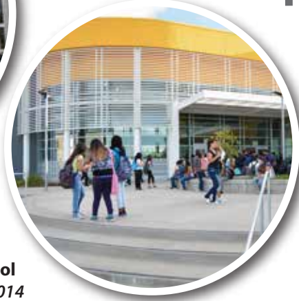
D. Gaston Middle School Completed: August 2014