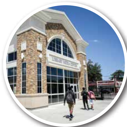
B. Administration Building at Fresno High School