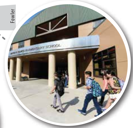
F. Olmos Elementary Completed: August 2007

Using Measure K, approved by voters in 2001, the district built five elementary schools, relieving crowding at some schools and allowing the district to move to one traditional calendar rather than having many schools on year-round schedules. It also built the Rutherford B. Gaston Sr. Middle School in southwest Fresno, bringing back a neighborhood middle school to the area for the