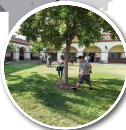
E. Classroom Wing at Roosevelt High School