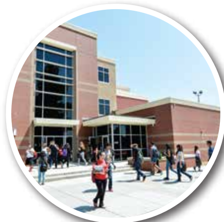
g. Classroom Building at McLane High School