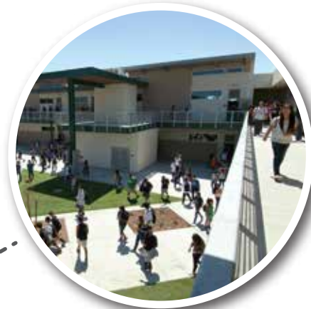
h. Classroom Building at Hoover High School