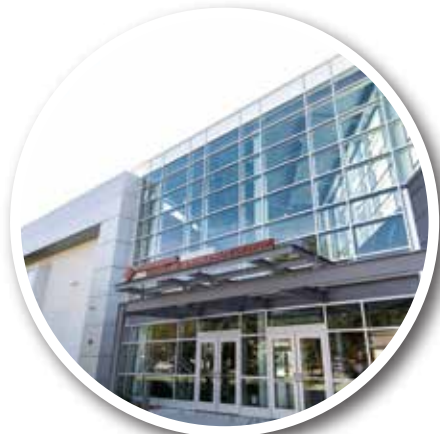
C. Phillip J. Patiño School of Entrepreneurship