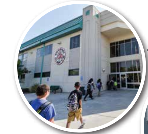
C. Yokomi Elementary Completed: August 2005