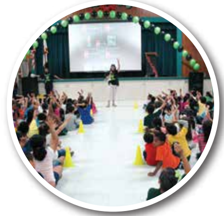
H. Thomas Elementary School Cafeteria Upgrades Completed: 2011