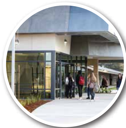
A. South Classroom Building at Bullard High School