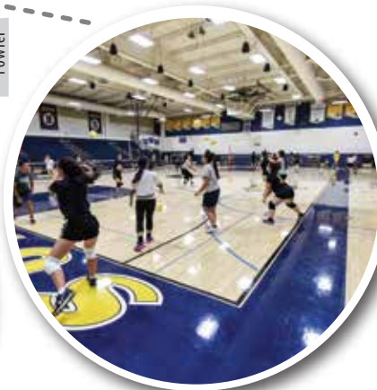
F. Gymnasium Floor at Sunnyside High School

Using Measure Q, approved by voters in 2010, the district made dramatic improvements to high schools, including new academic buildings and arts and athletic facilities. Measure Q also built the Phillip J. Patiño School of Entrepreneurship, which opened a year ago emphasizing technology and innovation.