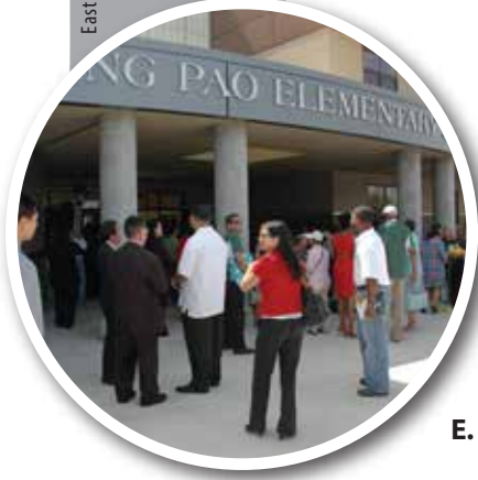
E. Vang Pao Elementary Completed: August 2012