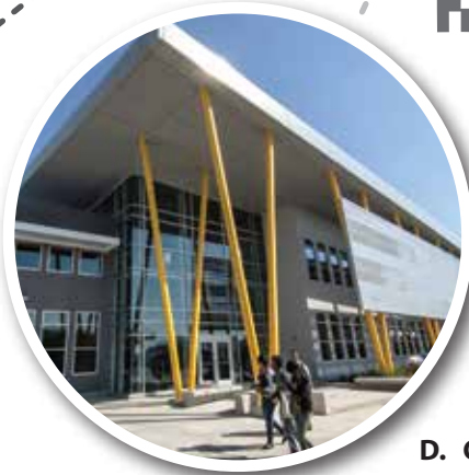
D. Classroom Building at Edison High School